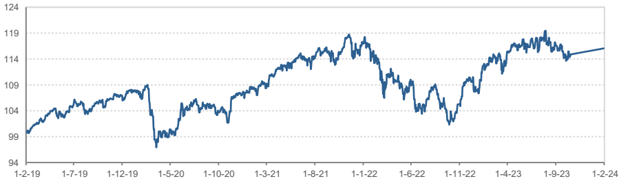
Net asset value evolution in baseline 100

Redemptions without fees on 4/07/16, 4/10/16, 11/01/17, 4/04/17, 4/07/17, 4/10/17, 11/01/18, 5/04/18, 4/07/18, 4/10/18, 11/01/19, 4/04/19, 4/07/19, 4/10/19, 13/01/20, 6/04/20, 6/07/20, 5/10/20, 11/01/21, 8/04/21, 5/07/21, 4/10/21, 11/01/22, 4/04/22, 4/07/22, 4/10/22, 11/01/23, 4/04/23 and 4/07/23 with at least 2 days' notice. The net asset value to be applied shall be that on the redemption date in each case, not being subject to the objective return.